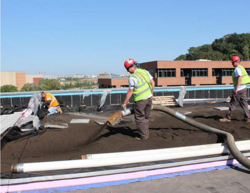
Media was pneumatically conveyed and blown on the roof in the 1 st phase.

The VRA is being completed in three phases, the first phase was completed in late Fall of 2011. Due to the variety of plants ranging from shrubs, to grasses, to sedum mats, there are four different soil blends on the project. “The growing media”, or “engineered soil” specification was adjusted in order to reduce the loads to within the structural tolerances for the roof structure. Roofmeadow provided assistance in modifying the specification. While maintaining the intent of the design to support plants that demand a range of pH, moisture, organic matter and nutrient levels, Roofmeadow influenced the specification in order to conform with materials and methods familiar to the green roof industry. Most of the growing media is being hoisted by crane. However, because some of Gordon’s own crane schedule conflicts, the media was pneumatically conveyed and blown on the roof for the first phase.