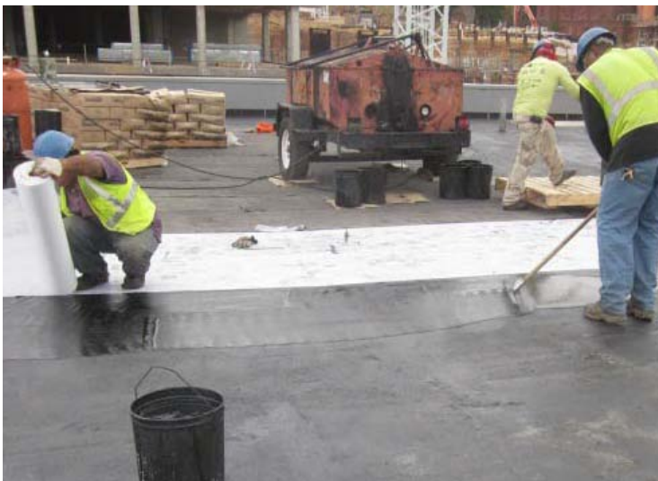
Crews installing hot rubberized asphalt.