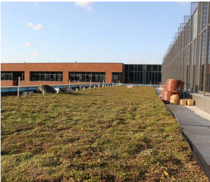
Roof planted exclusively with pre-grown sedum mats.

Between this project and the City Center project, also in DC, the Henry Company has close to one million sq. ft. of VRA under construction in the DC market alone. VRA's have become a permanent part of the landscape and are certainly a growth niche in the industry. You can see more on the project at: http://www.uscgproject.com/ .