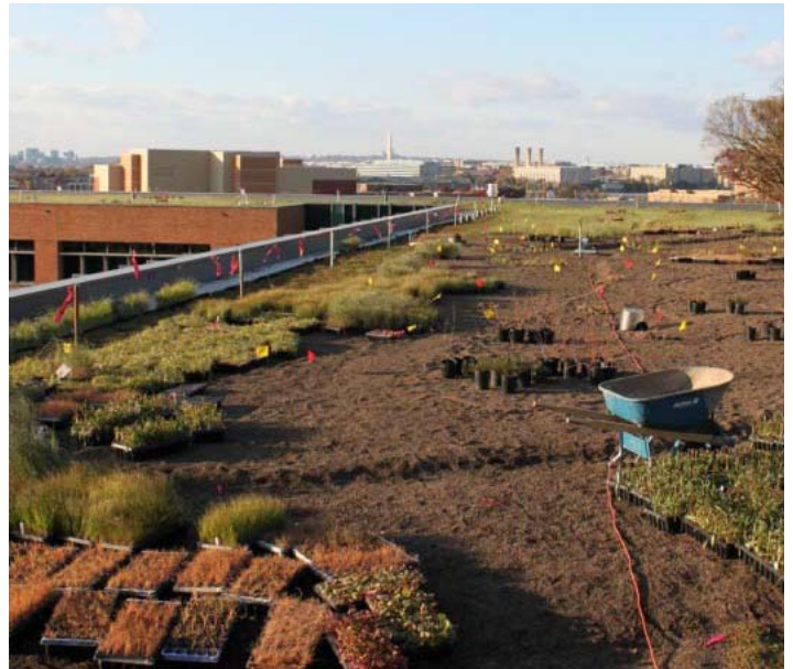
Sedum mats on the roof perimeter.

The long-term maintenance was given considerable thought. In addition to the very sustainable drip irrigation system utilizing on-site water, HOK worked with Clark to determine which parts of the roof would be least accessible, and thus most difficult to maintain. These roofs were planted exclusively with pre-grown sedum mats supplied by Sempergreen of Stevensburg, VA.