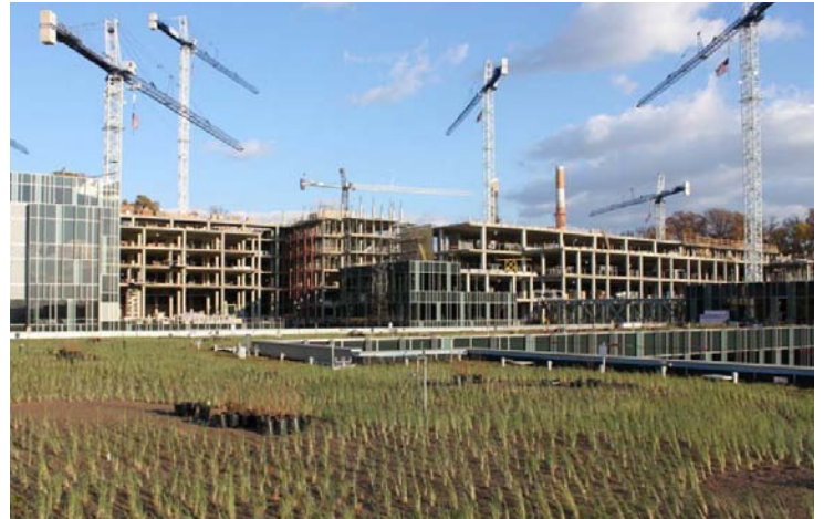
This VRA project is targeting LEED® Gold certification.

Vegetative Roof Assemblies (VRA) are sprouting up all over and the U.S. Coast Guard Headquarters 300,000 sq. ft. VRA in Washington, DC, is a prime example. Clark Construction is leading the design/build effort in conjunction with PPSI, WDG Architecture as the architect of record for the roofing and HOK for the roofing vegetative components. PPSI was the sales representative for the roofing system including the Hanover® concrete unit pavers and Emseal expansion joints. The project includes an eleven-story office building which will provide 1.2 million sq. ft. for 3,860 employees, a separate central utility plant and two seven-story parking garages. The whole project is built into a hillside and the elevation changes 120 feet on the 176 acre site. The project is targeting a LEED® Gold certification.