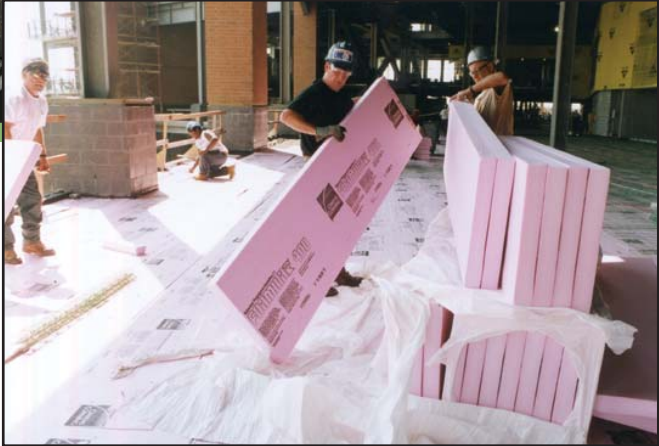
Lincoln Financial Field, Philadelphia, PA