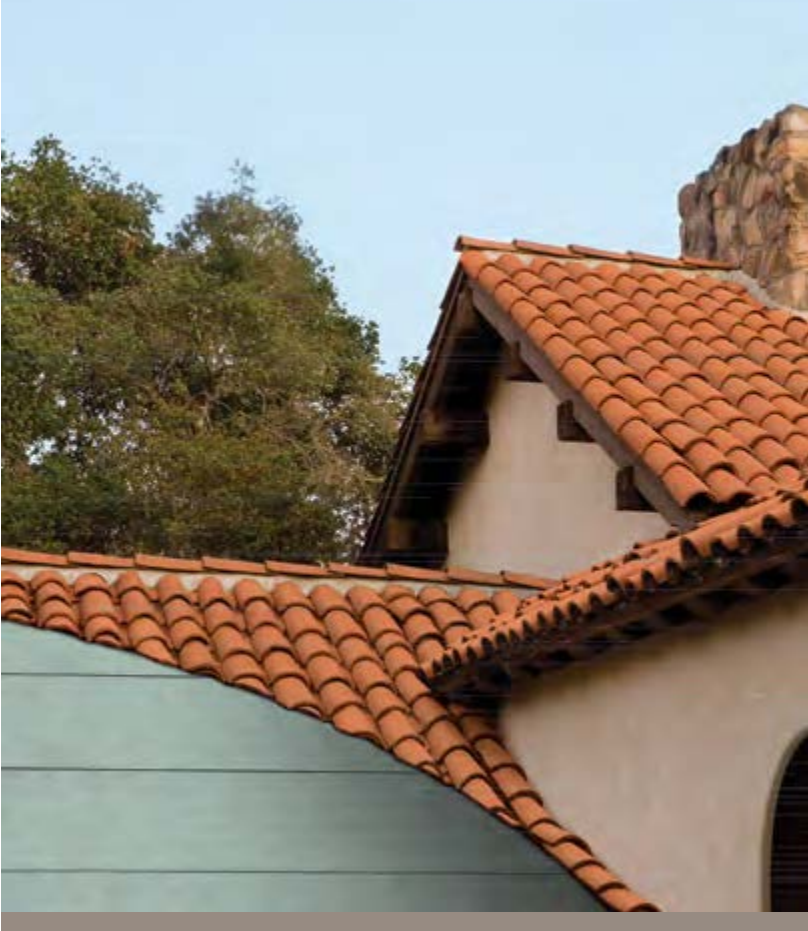
Excellent surface for foam adhesive set and mechanically fastened roof tile applications.