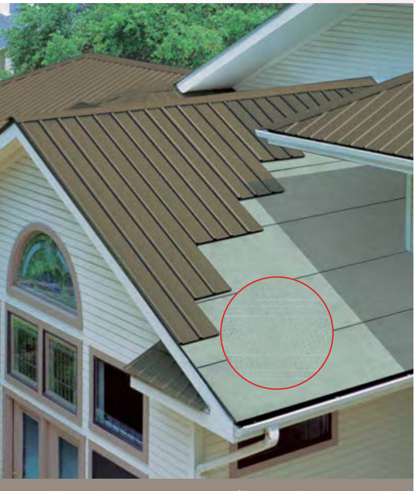
Withstands temperatures up to 260°F without fusing or degrading overlying metal roofing. Approved for use under all metal roof systems, including copper and zinc.