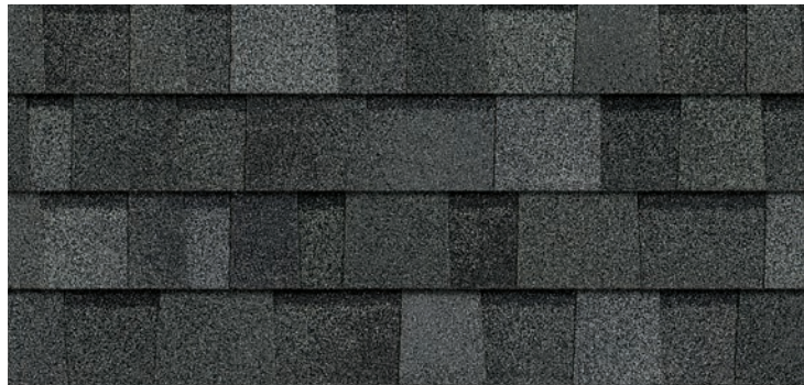
Estate Gray †