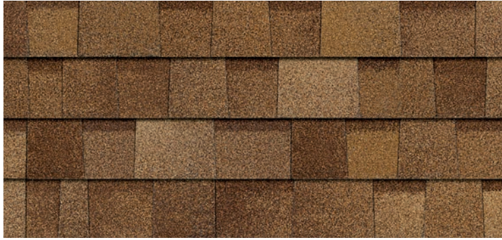
Desert Tan †