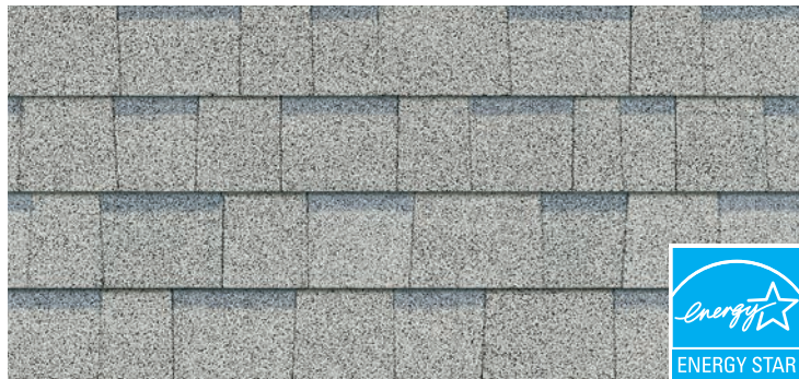
Shasta White †