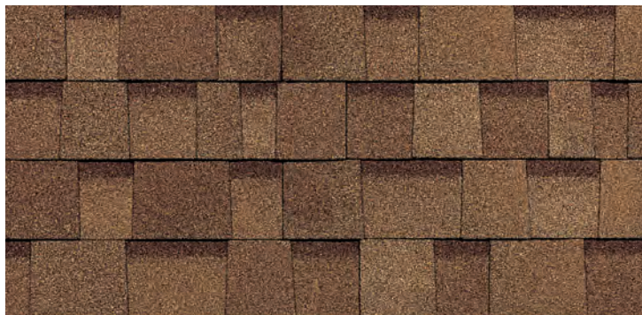
Desert Tan †