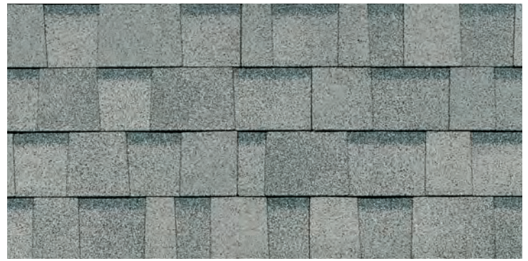
Antique Silver †

Home is where you want to feel the most comfortable and protected. It can be a source of pride and an expression of your personality. But when the time comes to purchase a new roof, it's easy to feel overwhelmed. Don't worry. Owens Corning Roofing and your contractor are here to help. We'll make it easy for you to select the right shingle for your type of home and sense of style. You can feel confident about choosing our roofing products. After all, we take pride in being America's most trusted Roofing Brand. §