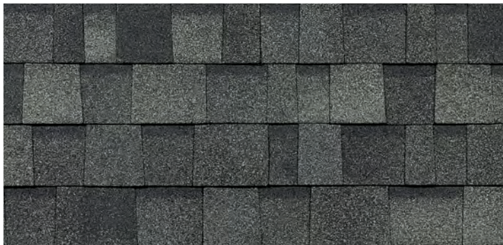
Estate Gray †