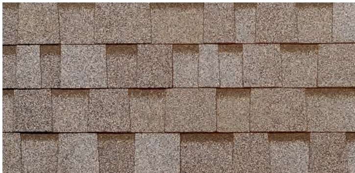
Beachwood Sand †