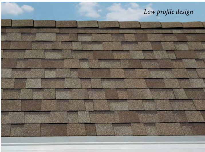
Low profile design