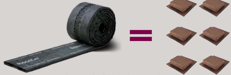
One RidgeCat™ 20-ft. roll delivers the same ventilation as six standard, off-ridge vents.