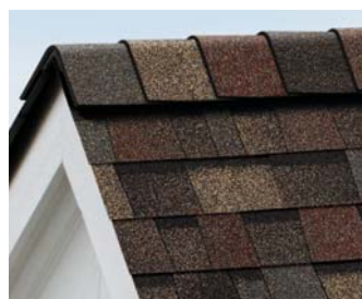
Summer Harvest †

High Ridge Hip & Ridge shingles also coordinate with the TruDefinition® Duration® Series Shingles Designer Colors Collection—this unique color-blended application is only available from Owens Corning™ Roofing.