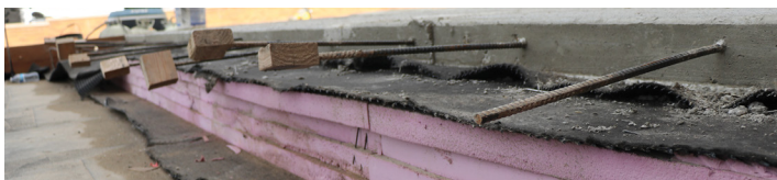
PRMA split slab assembly showing reinforced concrete topping slab over XPS with drainage board installed above XPS to promote vapor diffusion.