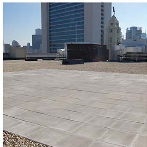
A roof system featuring concrete pavers and ballast in Chicago now is accepted by Chicago Code as a cool-roof system.

Oak Ridge, Tenn.-based Oak Ridge National Laboratory and the Waltham, Mass.-based Single Ply Roofing Industry recently issued a report that concludes after three years of testing that concrete pavers and ballast coverage of 17 pounds per square foot (83 kg/m 2 ) or greater provide benefits greater than actual cool-roofing membranes. The shade from the ballast also protects the membrane. Based on this report, the Sacramento-based California Energy Commission; Atlanta-based American Society of Heating, Refrigerating and Air-Conditioning Engineers Inc.; and city of Chicago have realized the benefits of ballast, giving designers another cool-roof-system option from which to choose. To learn more about ballasted roof systems as a cool-roofing option, read "Evaluating the Energy Performance of Ballasted Roof Systems" on SPRI's Web site, www.spri.net , or "cool roofing" in eco-structure's June 2008 issue, page 40.