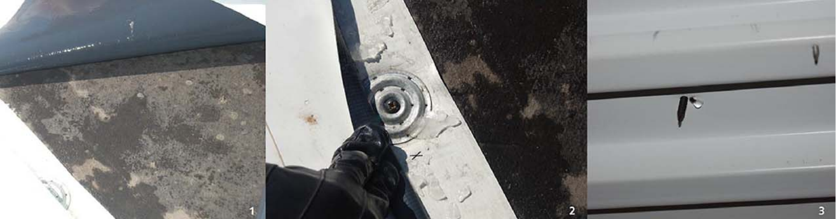
(1) Condensation below mechanically fastened cool-roof membranes in regions with cool nights is resulting in saturated insulation facers below the membrane. The results include mold growth, interior leaking and loss of wind-uplift performance caused by roof-deck corrosion. (2) Condensation below cool-roof membranes not only is saturating the insulation but resulting in ice build-up in the lap seams. (3) Moisture is dripping out of the errant screw hole. Repetitive wetting will result in roof-deck corrosion and, when located at screw fasteners, loss of wind-uplift resistance.

Single-layer-insulation applications allow the movement of moisture-laden air through the insulation joints to the underside of the membrane. In cold-temperature regions, this results in condensation. Although condensation can form on the underside of any loose-laid or mechanically fastened single-ply membrane, white membranes tend to accelerate and accentuate the accumulation of moisture because of the membrane's cooler temperatures, which may never be much higher than ambient temperature for the entire winter.