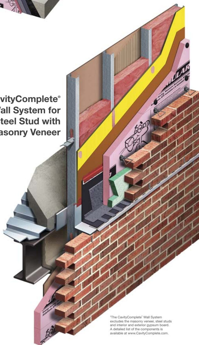
CavityComplete® Wall System for Steel Stud with Masonry Veneer

*The CavityComplete® Wall System excludes the masonry veneer, steel studs and interior and exterior gypsum board. A detailed list of the components is available at www.CavityComplete.com .