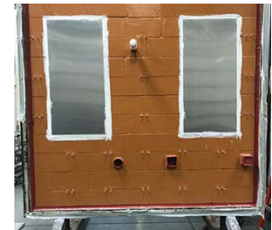
Photos: Penetrated wall during air leakage and water resistance testing