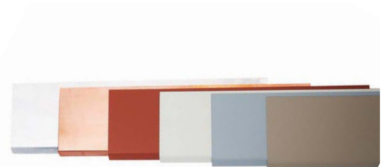
Left to right: Stainless Steel, Cold-Rolled Copper, Kynar-coated galvanized steel in 4 color choices — Terra-Cotta, Almond, Gray, Tan.