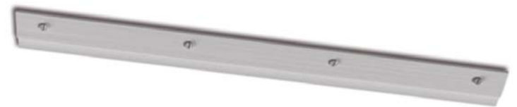
Termination bar: PVC