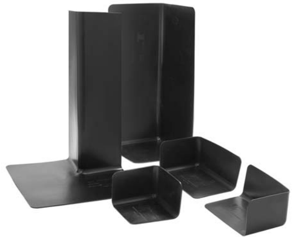
CompleteFlash™ Synthetic Rubber Components (left to right) 14" High Outside Corner Boot, Universal end dam, 14" High Inside Corner Boot, Left and Right end dams.