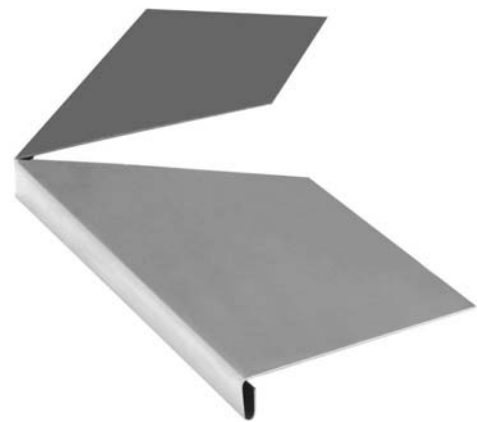
Adjustable metal drip edge corners

The CavityComplete® Wood Stud Wall System excludes the masonry veneer, wood studs, interior gypsum board and exterior sheathing. A detailed list of the components is available at www.CavityComplete.com .