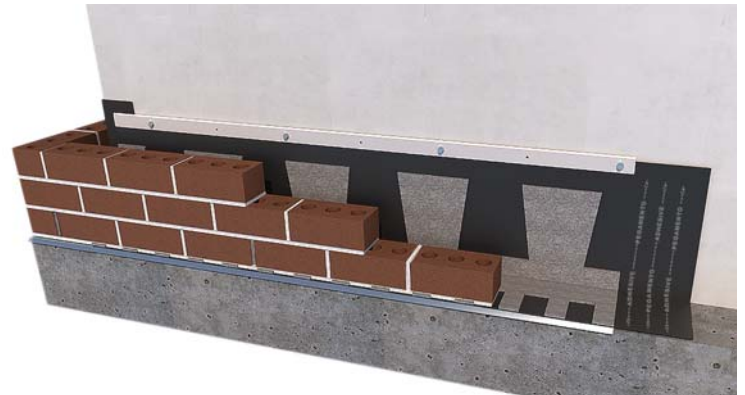
TotalFlash® pre-assembled panels 5-1/2' (5' net) panel (167.6 cm [152.4 cm net])

MPE-1 and BTL-1 sealant, CompleteFlash™ inside/outside corner boots, end dams, and adjustable metal drip edge inside/outside corners sold separately.