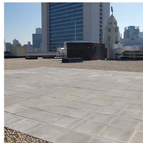
A roof system featuring concrete pavers and ballast in Chicago now is accepted by Chicago Code as a cool-roof system.

Oak Ridge, Tenn.-based Oak Ridge National Laboratory and the Waltham, Mass.-based Single Ply Roofing Industry recently issued a report that concludes after three years of testing that concrete pavers and ballast coverage of 17 pounds per square foot (83 kg/m 2 ) or greater provide benefits greater than actual cool-roofing membranes. The shade from the ballast also protects the membrane. Based on this report, the Sacramento-based California Energy Commission; Atlanta-based American Society of Heating, Refrigerating and Air-Conditioning Engineers Inc.; and city of Chicago have realized the benefits of ballast, giving designers another cool-roof-system option from which to choose. To learn more about ballasted roof systems as a cool-roofing option, read "Evaluating the Energy Performance of Ballasted Roof Systems" on SPRI's Web site, www.spri.net , or "cool roofing" in eco-structure's June 2008 issue, page 40.