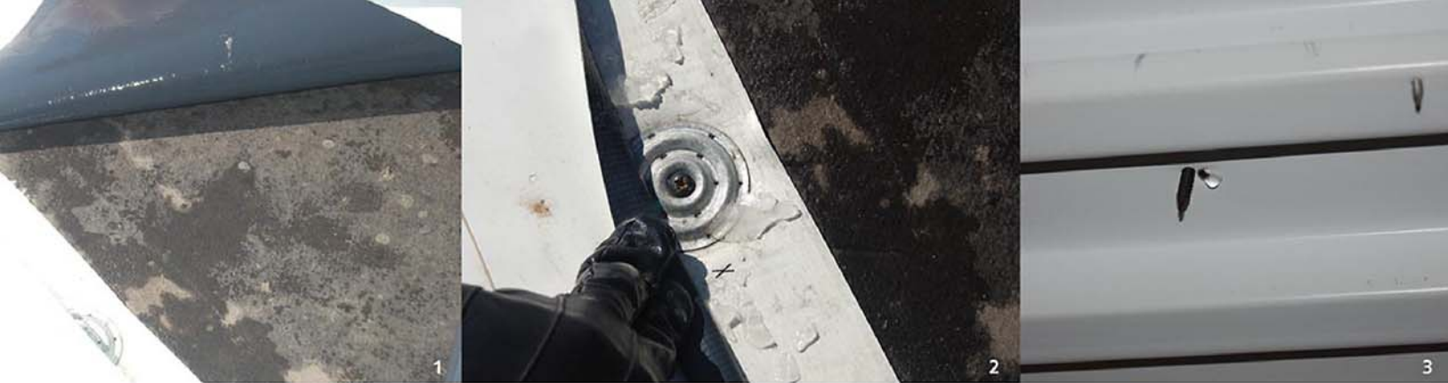
(1) Condensation below mechanically fastened cool-roof membranes in regions with cool nights is resulting in saturated insulation facers below the membrane. The results include mold growth, interior leaking and loss of wind-uplift performance caused by roof-deck corrosion. (2) Condensation below cool-roof membranes not only is saturating the insulation but resulting in ice build-up in the lap seams. (3) Moisture is dripping out of the errant screw hole. Repetitive wetting will result in roof-deck corrosion and, when located at screw fasteners, loss of wind-uplift resistance.

Single-layer-insulation applications allow the movement of moisture-laden air through the insulation joints to the underside of the membrane. In cold-temperature regions, this results in condensation. Although condensation can form on the underside of any loose-laid or mechanically fastened single-ply membrane, white membranes tend to accelerate and accentuate the accumulation of moisture because of the membrane's cooler temperatures, which may never be much higher than ambient temperature for the entire winter.