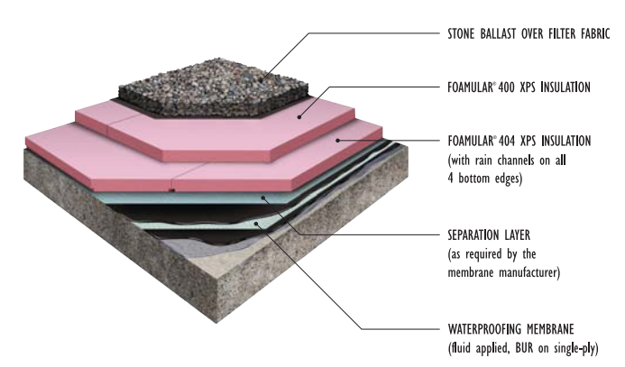
Stone Ballasted Waterproofing System