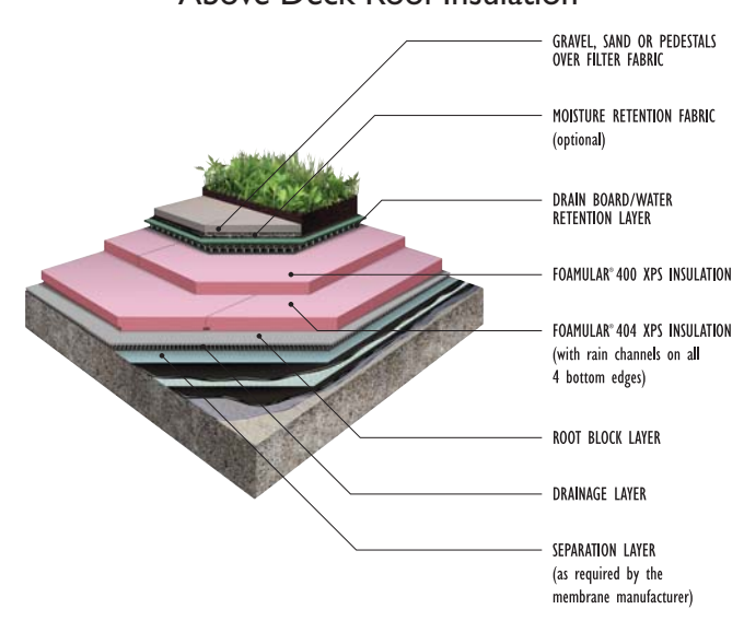
Vegetated Waterproofing System