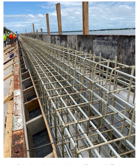
Project designed by Johnson, Mirmiran & Thompson (JMT), with repair completed by Gulfstream Construction (general contractor) and Palmetto Gunite (subcontractor)

*Based on sample testing of #5 rebar, fiberglass rebar exhibits linear-elastic behavior to increase ultimate tensile strength.