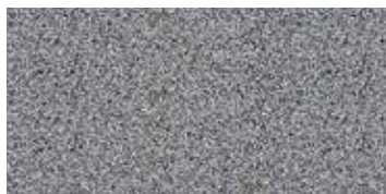
Sierra Gray 1