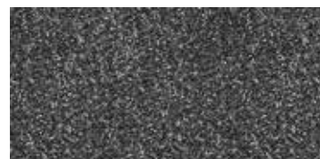
Slatestone Gray 1