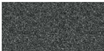
Estate Gray 1