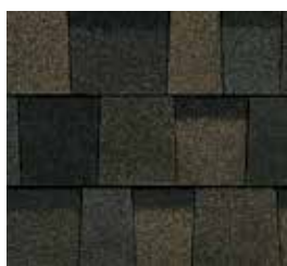
Black Sable 1

ProEdge® Hip & Ridge shingles coordinate with TruDefinition® Duration® Shingles Designer Colours Collection.