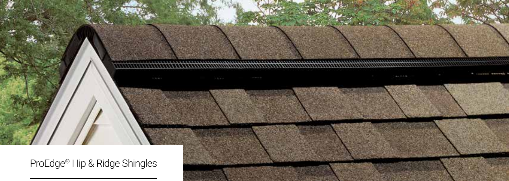
ProEdge® Hip & Ridge Shingles