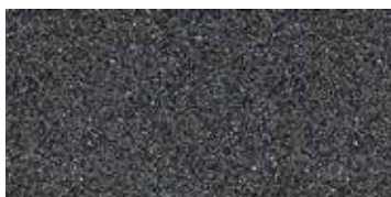
Williamsburg Gray 1