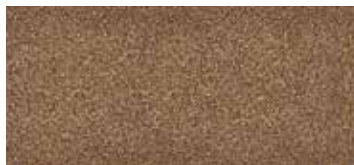
Desert Tan 1