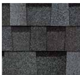
Pacific Wave 1