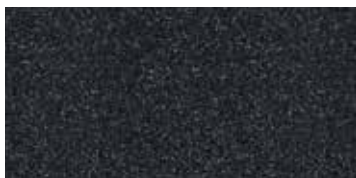
Onyx Black 1