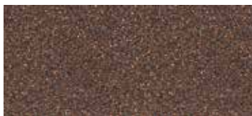
Desert Rose 1